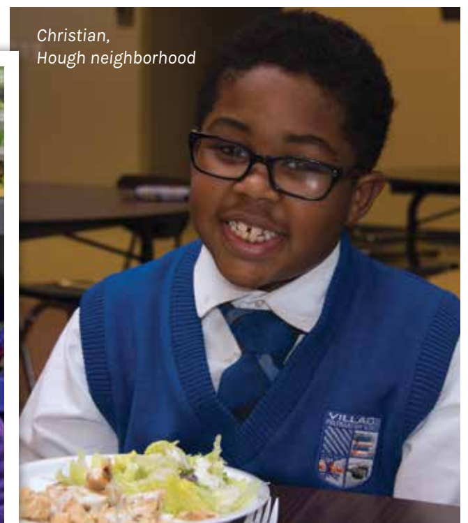
Christian, Hough neighborhood