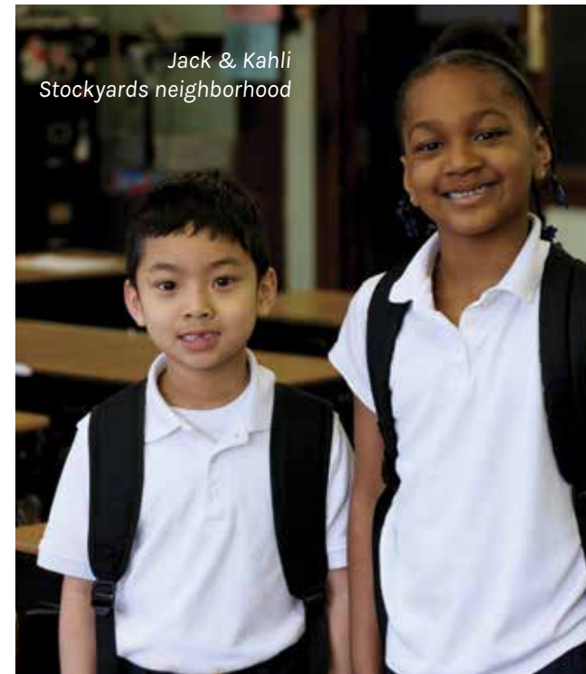
Jack & Kahli Stockyards neighborhood